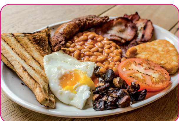
An English breakfast