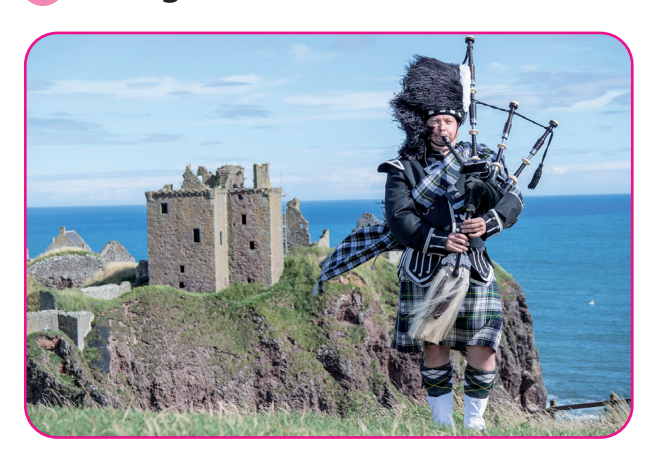
A man playing bagpipes